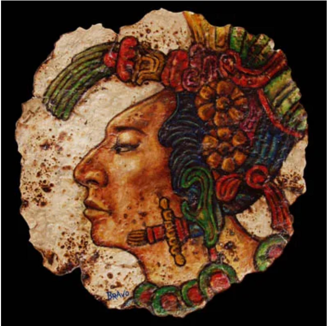
Joe Bravo's "Maya," painted on a corn tortilla, reframes an iconic Latin image.

of contemporary artists living and working in California, all of whom explore the meaning of Latino tradition by probing, questioning, and reworking the images and iconic symbols of Latino heritage. Although Wolff has purposefully chosen artists with varying degrees of education and professional experience in art-making, there is a common impulse between them. By evoking a spirit of self-critique and identity politics, these artists question the very term "tradition."