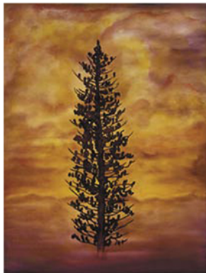
Linda Vallejo, Golden Yucca , Oil on Canvas

El Pueblo de Los Angeles, 125 Paseo de la Plaza, Los Angeles 213.624.3660 www.mexicanculturalinstitute.com