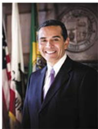
Antonio Villaraigosa Mayor City of Los Angeles