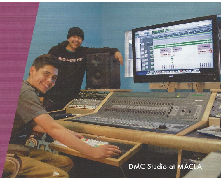
DMC Studio at MACLA

SONIDO CLASH | JUN 2, 2017 Future Latino Sounds