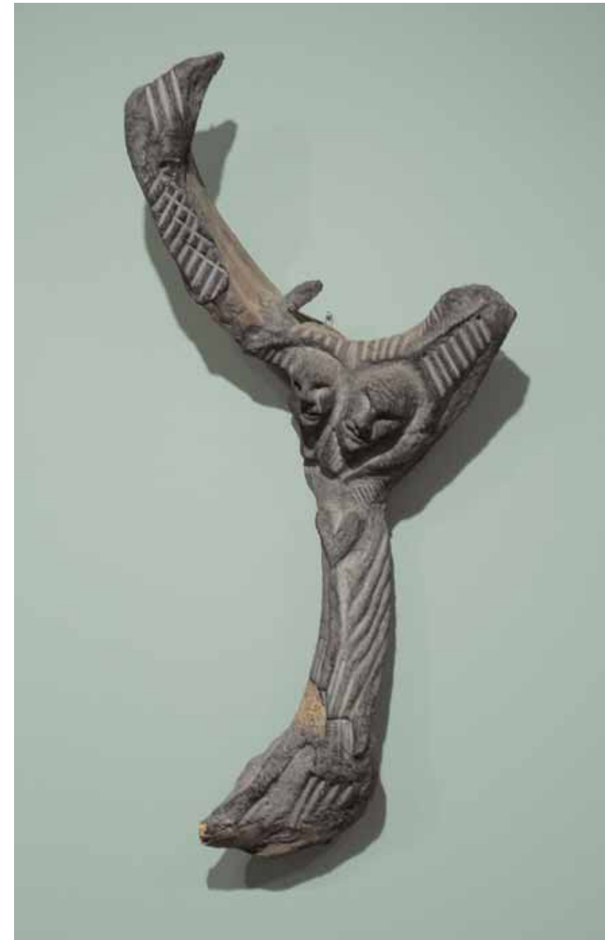
TWIN HEARTS, tree fragment, handmade paper, and Procion dyes, 48"x 30"x 11", 1990

COVER: A PRAYER FOR THE EARTH ECO INSTALLATION includes paintings, sculpture and central mandala. Central Mandala, manipulated photographs, stone, volcanic rock, shell, coral, feathers, ash, obsidian, tree and plant materials.