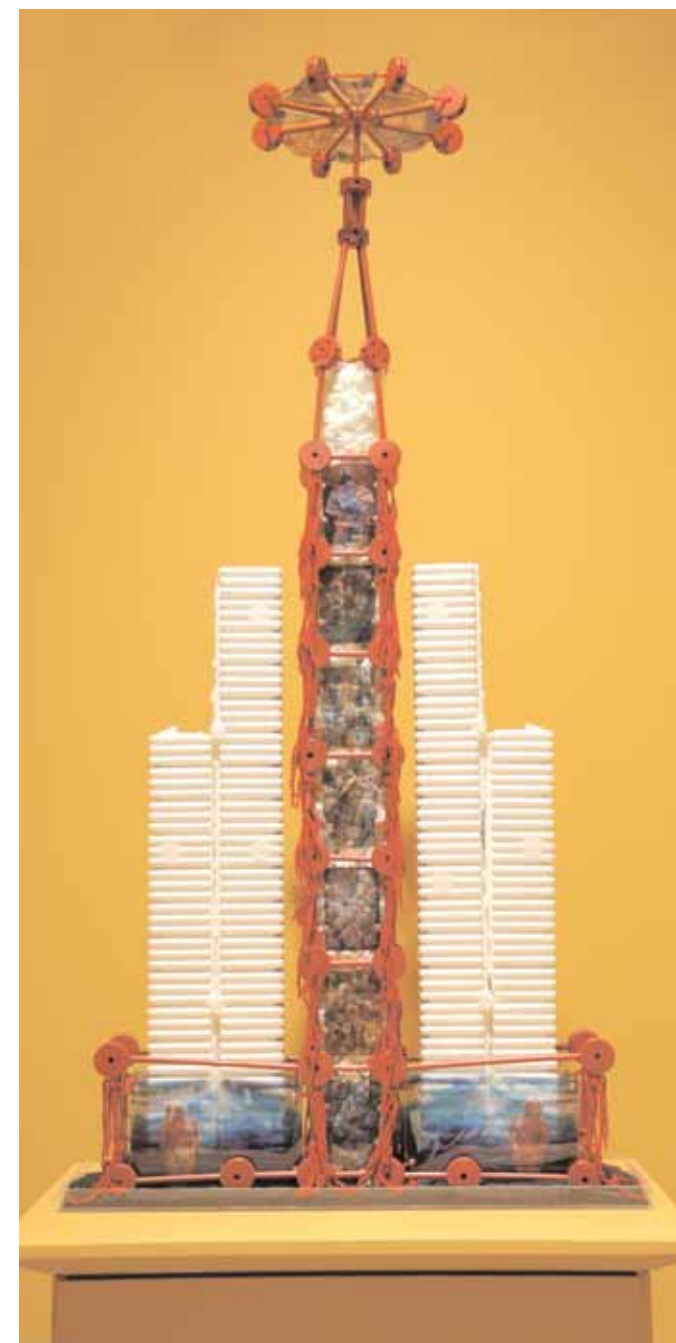
THE ROCKET, Tinkertoys, prints of original paintings, recycled Styrofoam, Mylar, yarn, and rubber tubing, 64"x32"x10", 2008