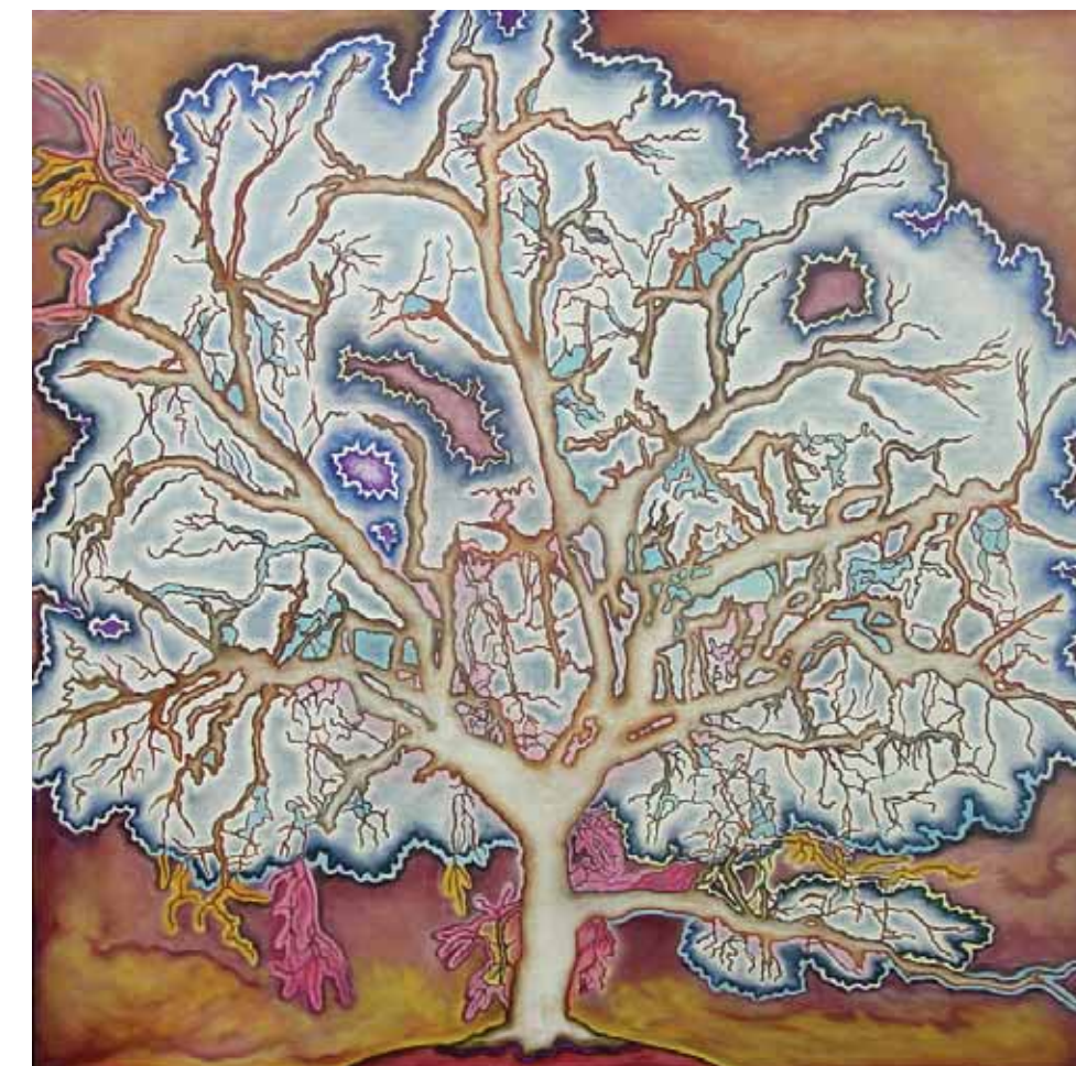
ELECTRIC OAK SPRING EQUINOX, oil on canvas, 30" x 30", 2007