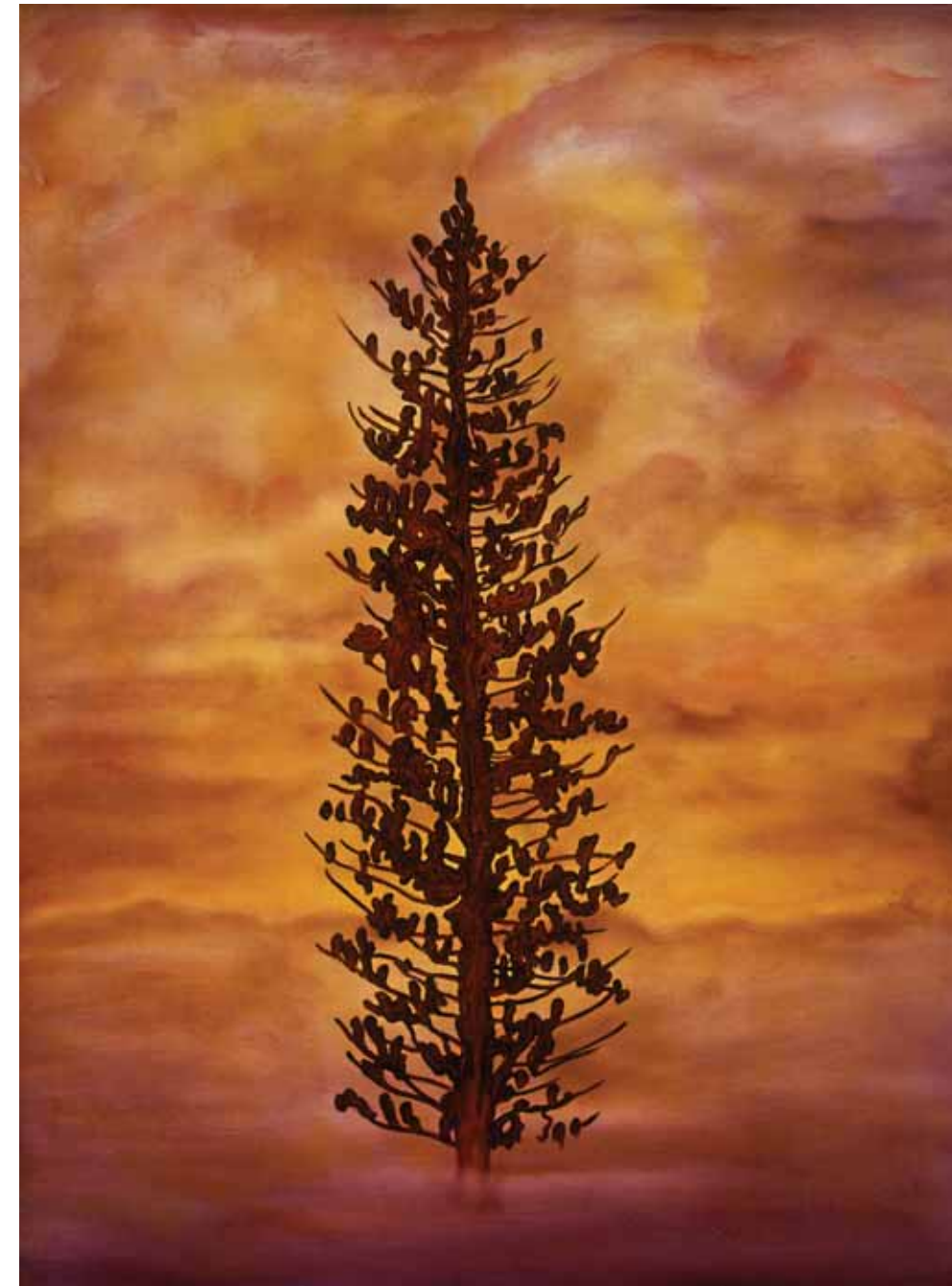
GOLDEN YUCCA, oil on canvas, 40" x 30", 2006

sort of Tree of Life symbol. When she focuses on individual trees, as in Golden Yucca (2006), she gives them the dignity and mystery of portraits. The artist lives in an area surrounded by venerable but endangered oaks, and these have become the basis for a series of "electrified" paintings: the trees appear to glow with an almost otherworldly light. "When I look back on these works now, I can see that what's happened is my almost supernatural vision of the tree," Vallejo says. "The electric trees echo my experiences with ceremony." They also recall the reverence and animation that artists like van Gogh and O'Keeffe brought to their paintings of the natural world.