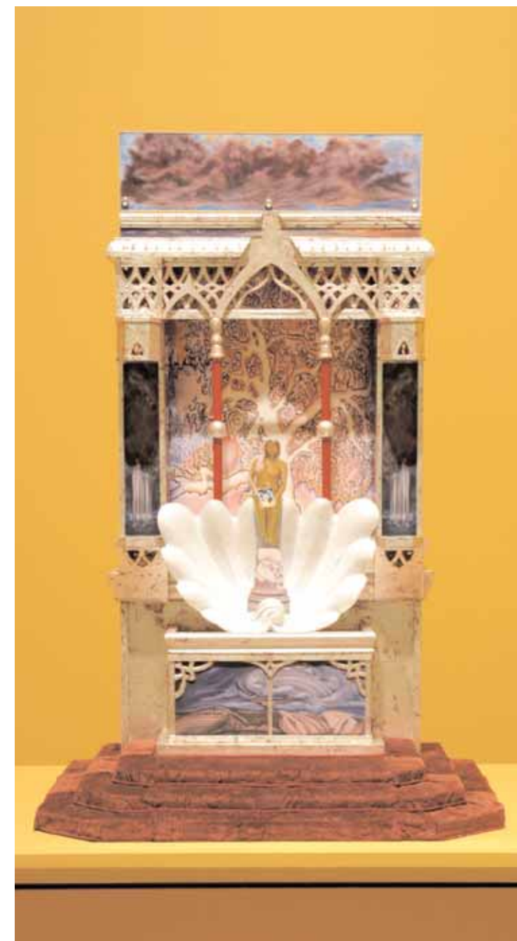
EARTH'S ALTAR SILVER, prints of original paintings, wooden structure, gold leaf, plaster, Styrofoam, Mylar, Plexiglas, velveteen, plastic beads, and yarn, 40"x24"x20", 2008