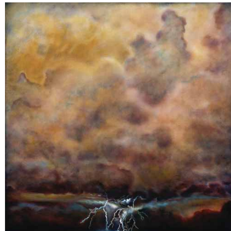
THUNDER, LIGHTENING AND RAIN, oil on canvas, 48" x 48", 2006