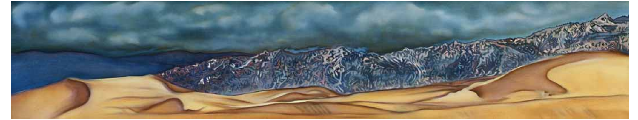
DEATH VALLEY, STOVEPIPE DUNES, oil on canvas, 12" x 60", 2006