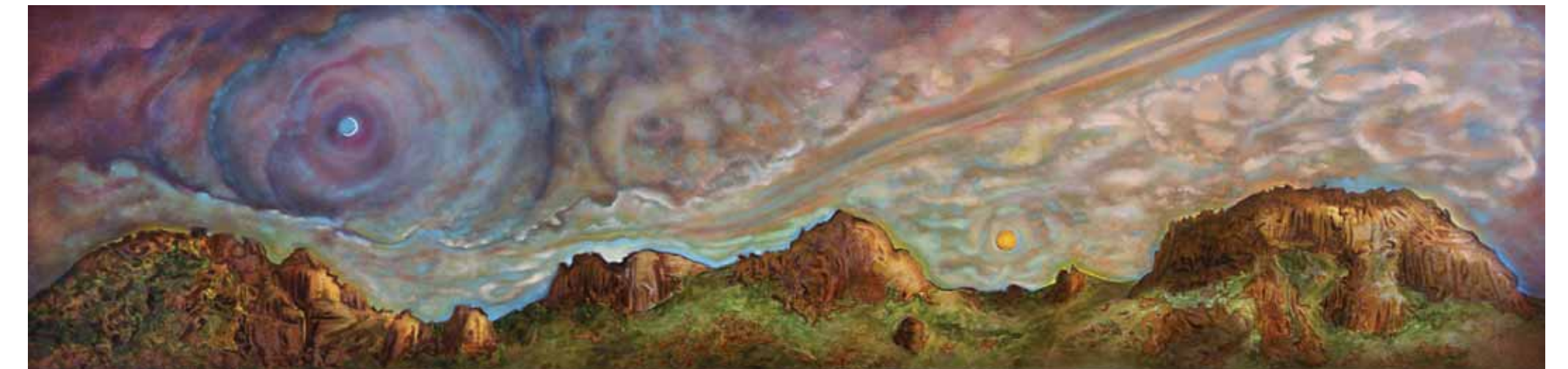
CALIFORNIA HORIZONS, BONEY RIDGE, oil on canvas, 18" x 72", 2006