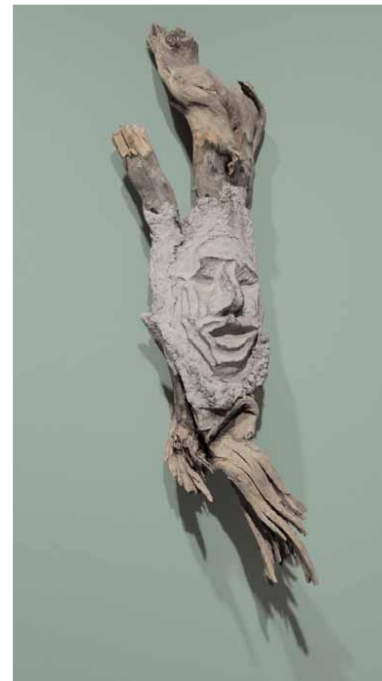
BROTHER TREE, tree fragment, handmade paper, and Procion dyes, 30"x14"x10", 1990