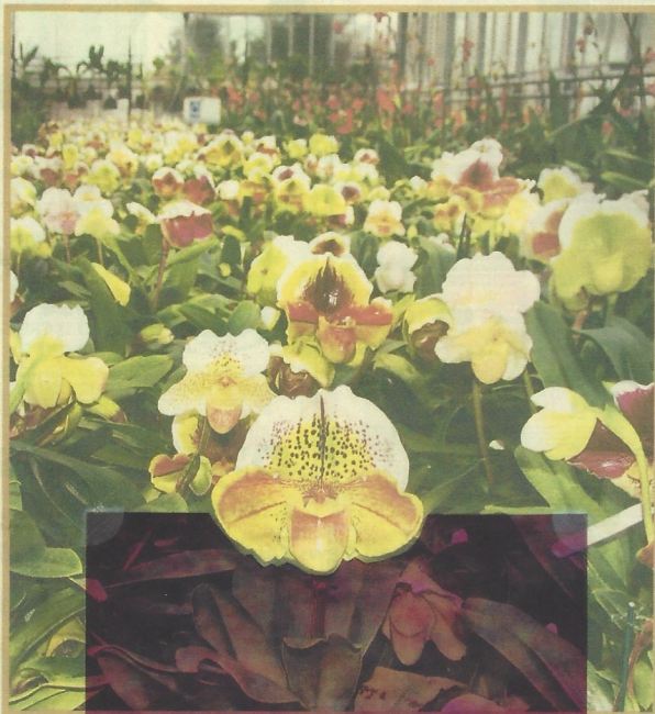
HOTHOUSE BEATERS Paphiopedilum orchids get another boost from the first spring crop of Paphiopedilum, a Dutch orchid grower in Jersey, after a record of France.